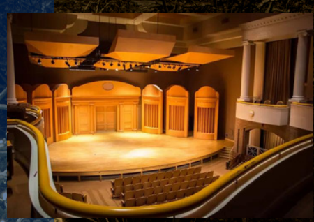
Falany Performing Arts Center

Renowned, intimate venue at Falany Performing Arts Center, Reinhardt Campus